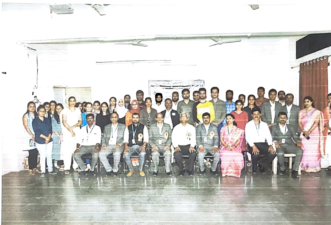
Group Photos of the One-Day State Level Seminar on " Publication Guidelines and Ethics "